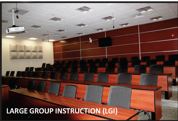
LARGE GROUP INSTRUCTION (LGI)